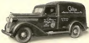
ONE OF THE FLEET—A CHILTON ADVERTISING CAR